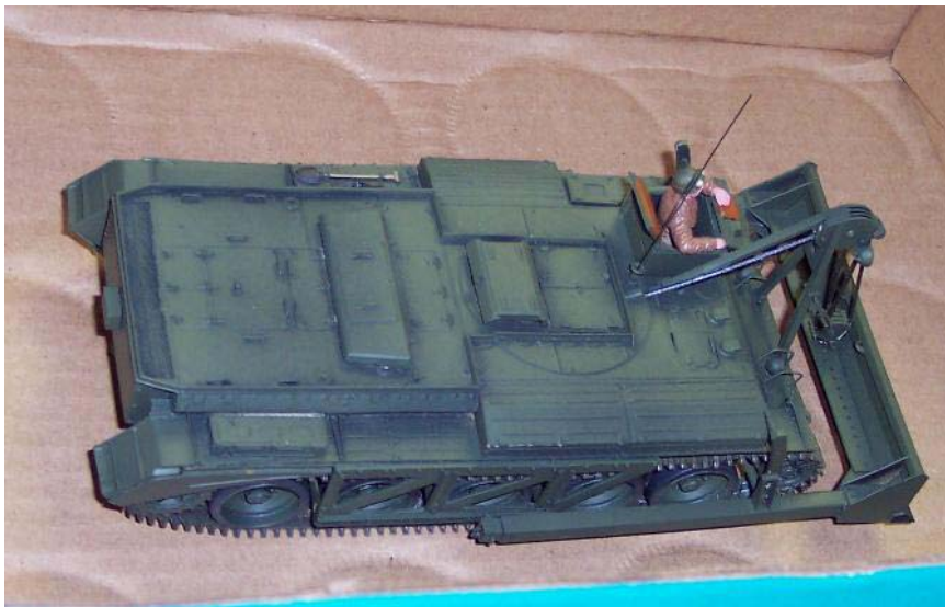
← Ed's Centaur Dozer