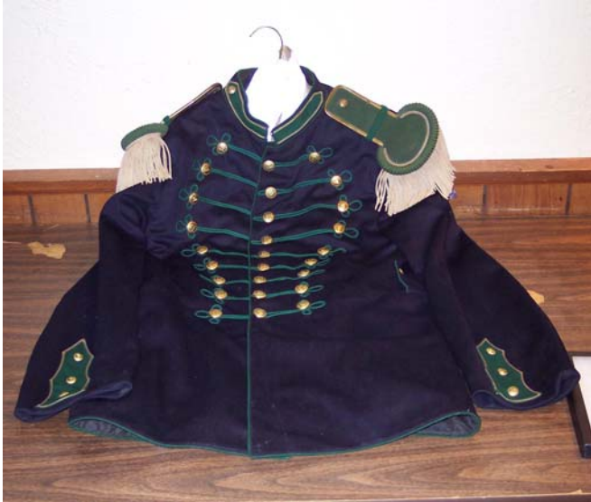
Len Schwalm's NJ NG 2 nd Regt uniform