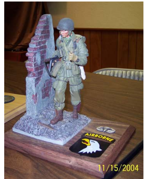
Jeff Hearne's incredible large-scale figures