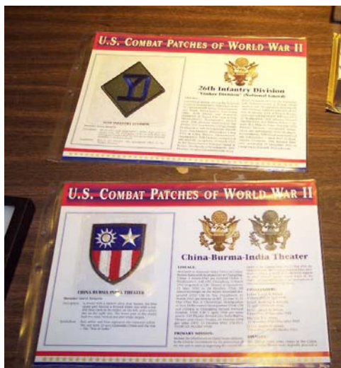
Harmon's Uniform patches w/ histories