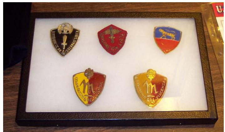
Bruce's Italian arm badges